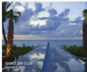
GRACE BAY CLUB INFINITI BAR

with the distinctive charm of a beachfront location. The Estate includes exclusive facilities such as a poolside bar, poolside cabanas and lounges, a 25-meter lap pool, beach beds, a Jacuzzi, a kids' splash pool and a welcome lounge,