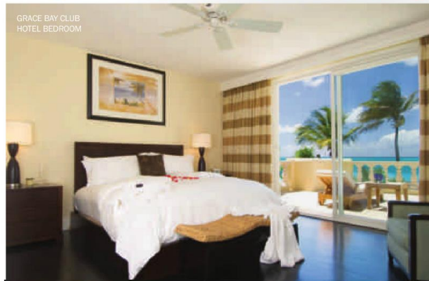
GRACE BAY CLUB HOTEL BEDROOM