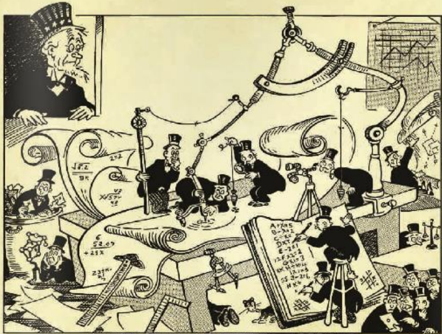
THE BOUNTY PURSUERS OF CAPITAL HILL — FINANCIAL IS A WAY TO ENTER TRADE WITHOUT LEAVING A SINGLE WORD. DAVE COVERLY

BILLIONAIRES GONE WILD! BY DAVID LETTERMAN AND BRUCE MCCALL THE SECRET ART OF DR. SEUSS HOUSE OF OUTRAGEOUS FORTUNE: 15 CPW SPECIAL GUIDE: SCHOOLS/COLLEGES/UNIVERSITIES/SUMMER PROGRAMS